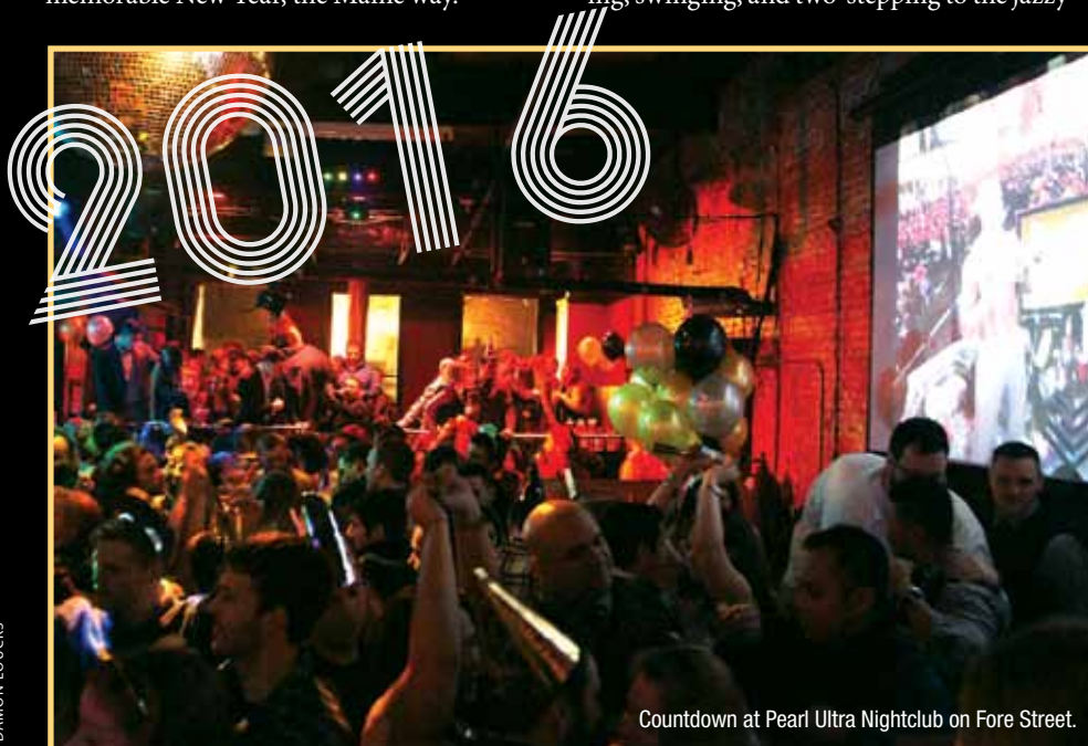
Countdown at Pearl Ultra Nightclub on Fore Street.

For a night of mystery, head to the Marriott Sable Oaks for their Midnight Masquerade (200 Sable Oaks Drive, South Portland, 871-8000, Marriott.com) or dance the night away (quite literally) at Maplewood Ballroom Dance (383 Warren Avenue, Portland, 878-0584, maplewooddancecenter.com.)