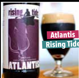
Atlantis Rising Tide