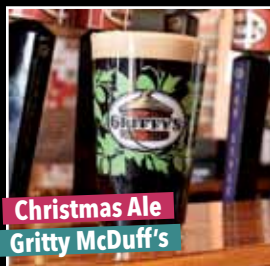
Christmas Ale Gritty McDuff's