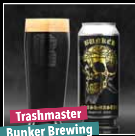
Trashmaster Bunker Brewing