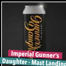
Imperial Gunner's Daughter - Mast Landing

Samara Brown isn't your typical brown ale. Brewed with locally roasted Bard Coffee and maple syrup from Merrifield Farm, the imperial brown plays sweetness and bitterness off one another to great effect. And, at 7 percent ABV, just a pint will warm you up on the coldest winter days.