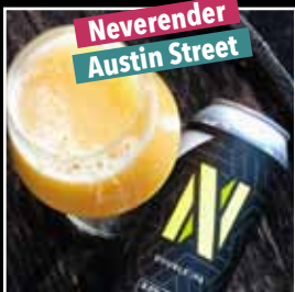
Neverender Austin Street