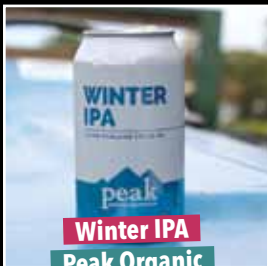
Winter IPA Peak Organic