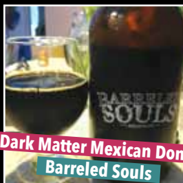
Dark Matter Mexican Donut Barreled Souls