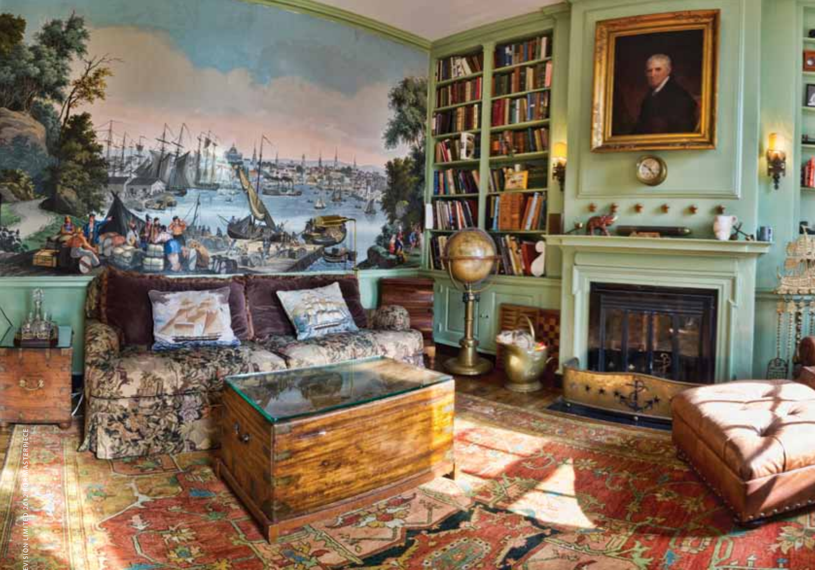
CLOCKWISE FROM TOP LEFT: CYNTHIA FARR-WEINFELD (2); COURTESY OF LORD AND LADY CARNARVON; CARNIVAL FILM & TELEVISION LIMITED, 2012; FROM MASTERPIECE