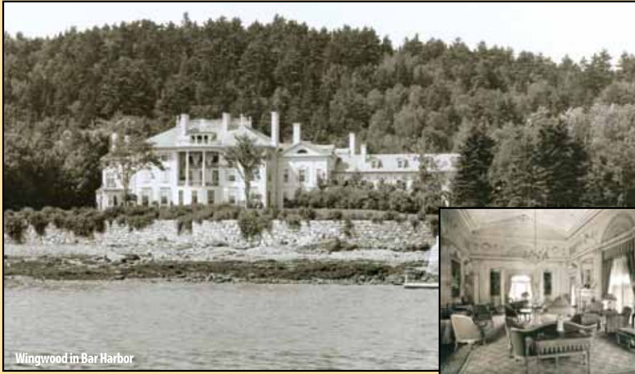
Wingwood in Bar Harbor

To find houses on the scale of a Downton Abbey in Maine, one has to look to Bar Harbor, where 30-, 40-, and 50-room summer cottages were not uncommon. These houses were supported not by landed estates but by Gilded Age industrial fortunes: vacation homes for America's plutocracy. Tales of intrigue and loyalty in the servant's halls of that resort—peopled by English butlers, French chefs, Irish maids, and Scottish gardeners—rival any to be found on Downton .