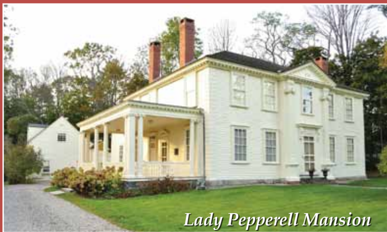
Lady Pepperell Mansion