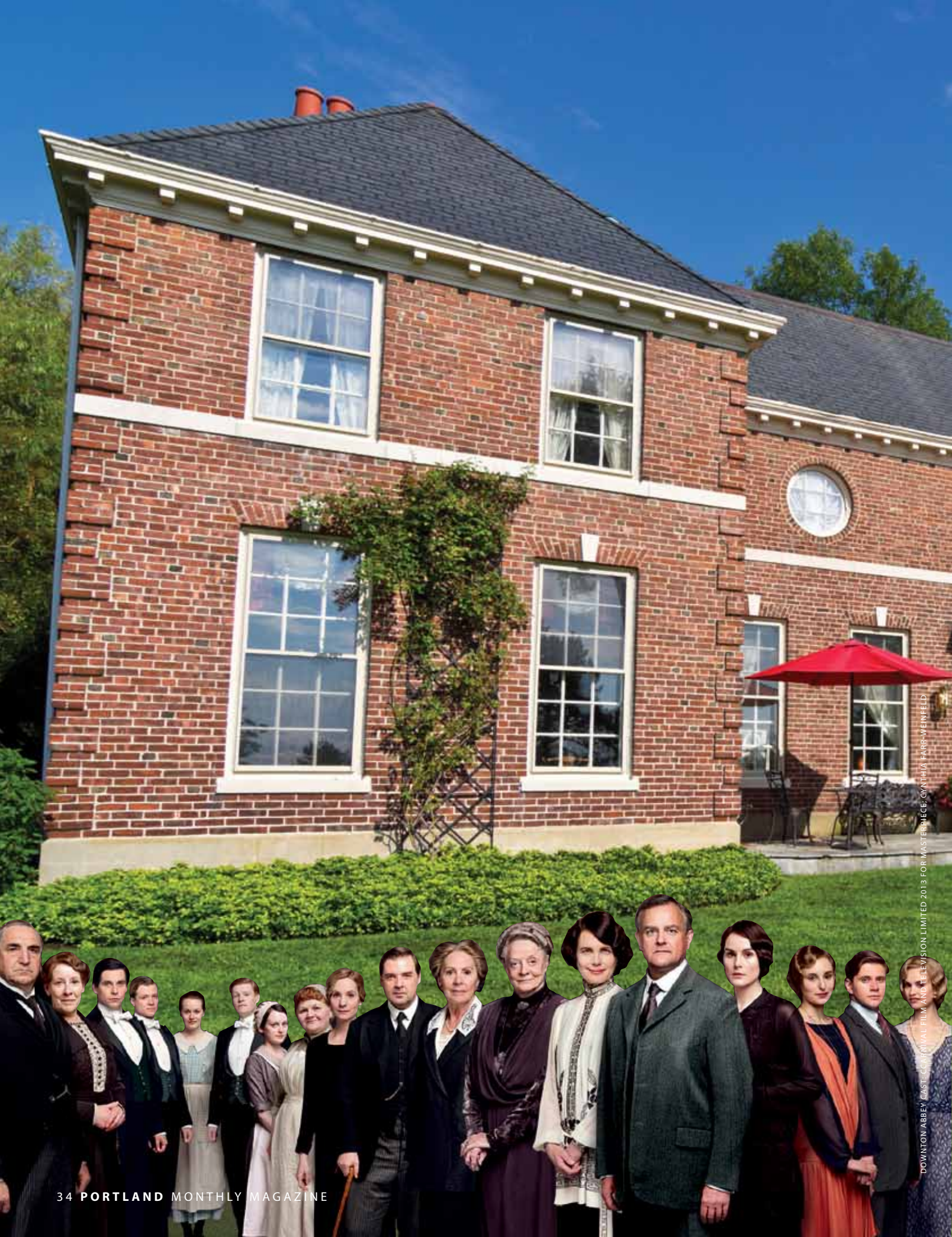
DOWNTON ABBEY: EAST END PRODUCTIONS; MASTERPIECE; CYNTHIA FARR-WEINFELD