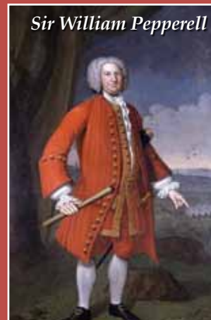
Sir William Pepperell

This adorable 1759 mansion, somehow cozy, crackles with six fireplaces and a grand staircase. Purchased in 2005 for nearly $1.5 million, the house invites the public to its gardens, private beach, and river views several times a year.