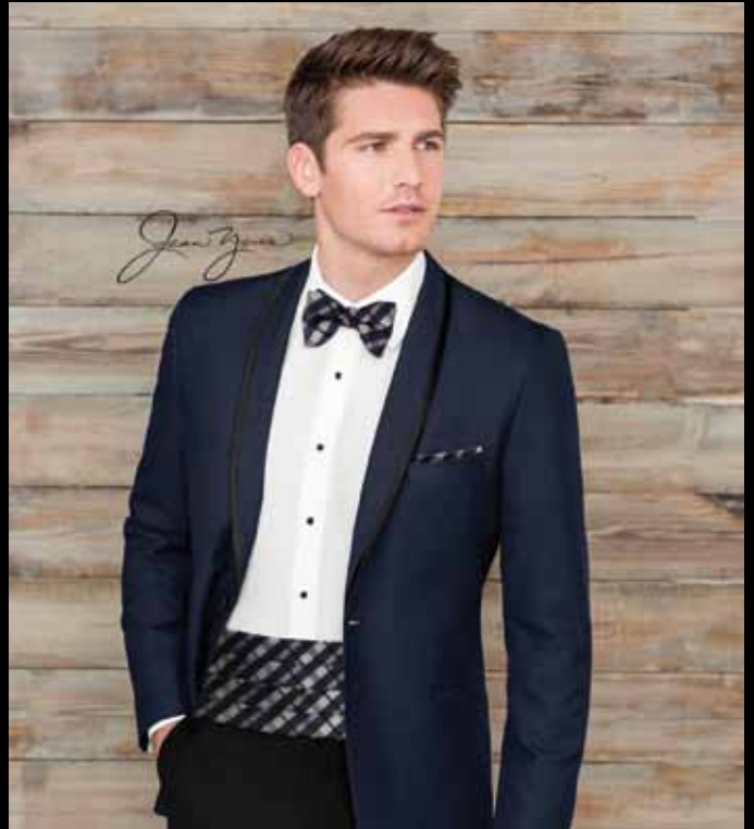
Jean Yves Sapphire Blue Calypso Tuxedo