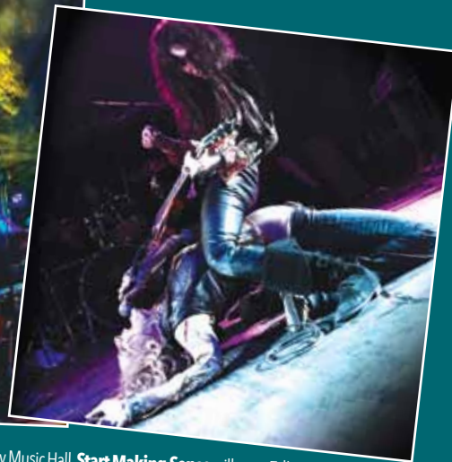
Double take: National tribute acts are ready to rock Port City Music Hall. Start Making Sense will cover Talking Heads on Jun. 16; and Lez Zeppelin , an all-female Led Zeppelin tribute band, will channel the songs and hairstyles of Robert Plant et al. on Mar. 30.