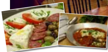
Six Course Italian Dinner for Two (Including a bottle of wine) $29 Per Person

Most romantic in the 1980s. Most romantic now.