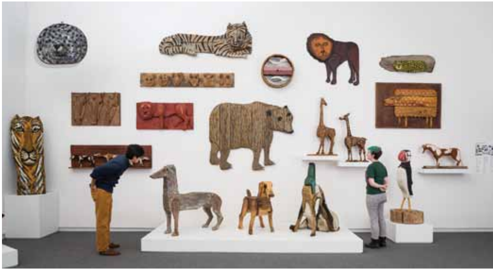
Installation view, Bernard Langlais Colby College Museum of Art.