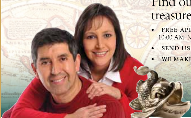
Faberge Silver Caviar Presentoir sold for $28,750

FINE ART | ANTIQUES | DECORATIVE ITEMS | JEWELRY | COINS | VEHICLES