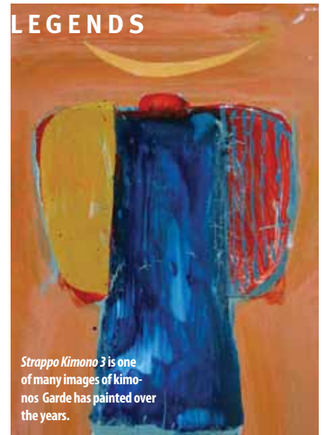
Strappo Kimono 3 is one of many images of kimono Garde has painted over the years.