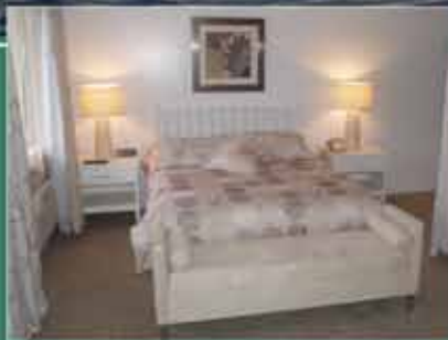
New - Suites!

GREAT FOOD • GREAT DRINKS • GREAT VIEWS GREAT PLACE TO STAY!