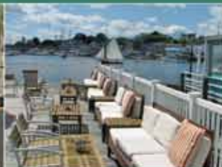
Comfortable Deck for Cocktails & Views of the Harbor