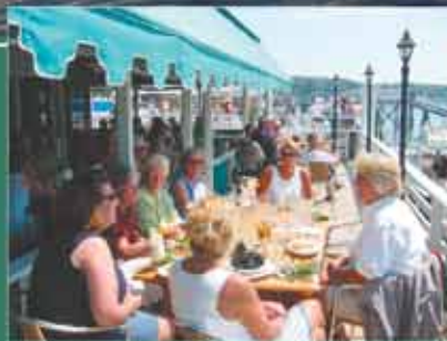
Inside & Outside Dining