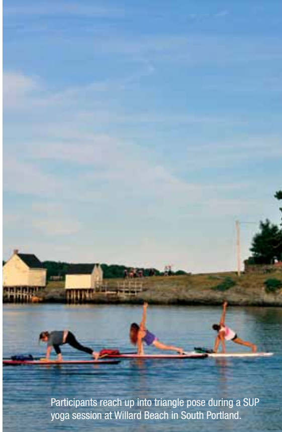
Participants reach up into triangle pose during a SUP yoga session at Willard Beach in South Portland.