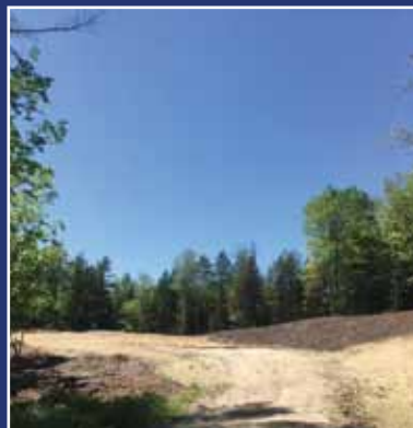
Estate size North Yarmouth lot! MLS# 1354135 | $154,900 Rachel Cooney 318-8177