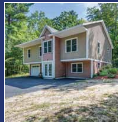
Coming soon in Windham! MLS# 1368956 | $335,000 Campbell/DiCenso Team 766-6222