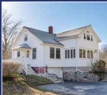
Affordable Falmouth home! MLS# 1346954 | $270,000 Kermit Stanley 671-3405