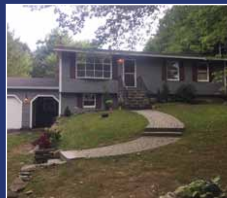
Coming soon in Windham! $279,900 Rachel Cooney 318-8177