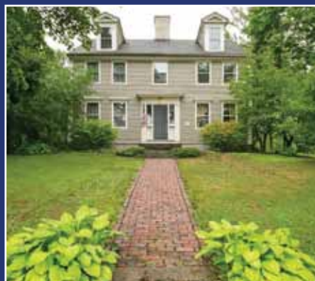
Featured in this issue of Portland Monthly! MLS# 1359912 | $534,000 Lynn Abood 807-6448