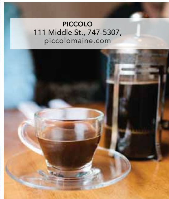
PICCOLO 111 Middle St., 747-5307, piccolomaine.com