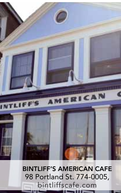
BINTLIFF'S AMERICAN CAFE 98 Portland St. 774-0005, bintliffscfe.com

There are greens braised in olive oil with fried eggs and toast, a frittata, or Ilma's zepoli (classy doughnut holes). You can even