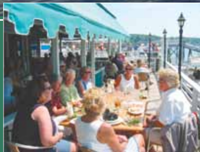
Inside & Outside Dining