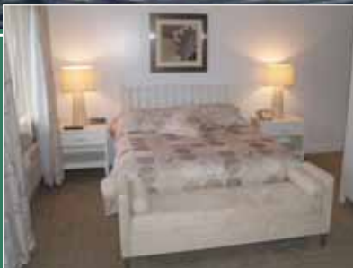
New - Suites!

GREAT FOOD • GREAT DRINKS • GREAT VIEWS GREAT PLACE TO STAY!