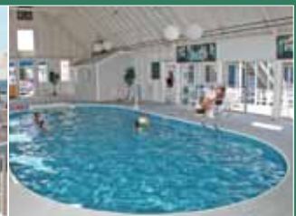
Indoor Heated Pool

633-4455 • 1-800-ROC-TIDE • (1-800-762-8433) • rocktideinn.com 35 Atlantic Avenue • Boothbay Harbor, Maine 04538