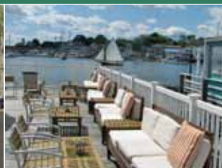
Comfortable Deck for Cocktails & Views of the Harbor