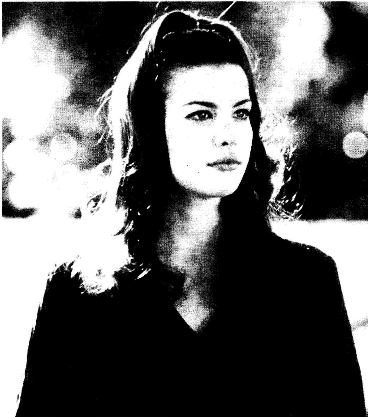
PHILIP CARUSO, 20th Century Fox