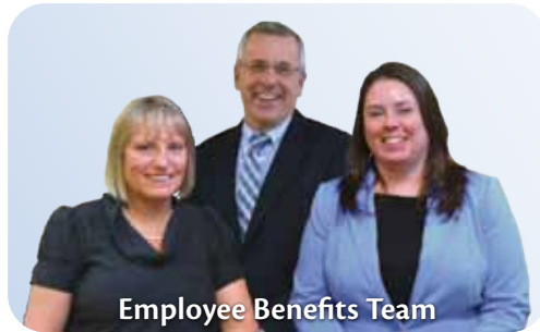
Employee Benefits Team

We're there when it matters most with friendly, trusted insurance advice. We can help you find the most affordable health care plan with no additional cost to you or your company.