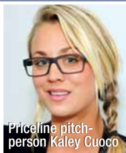
Priceline pitchperson Kaley Cuoco

In 2008, the trio of Priceline, Orbitz, and Expedia was 7 percent of WEX’s business; now it’s 25 percent.