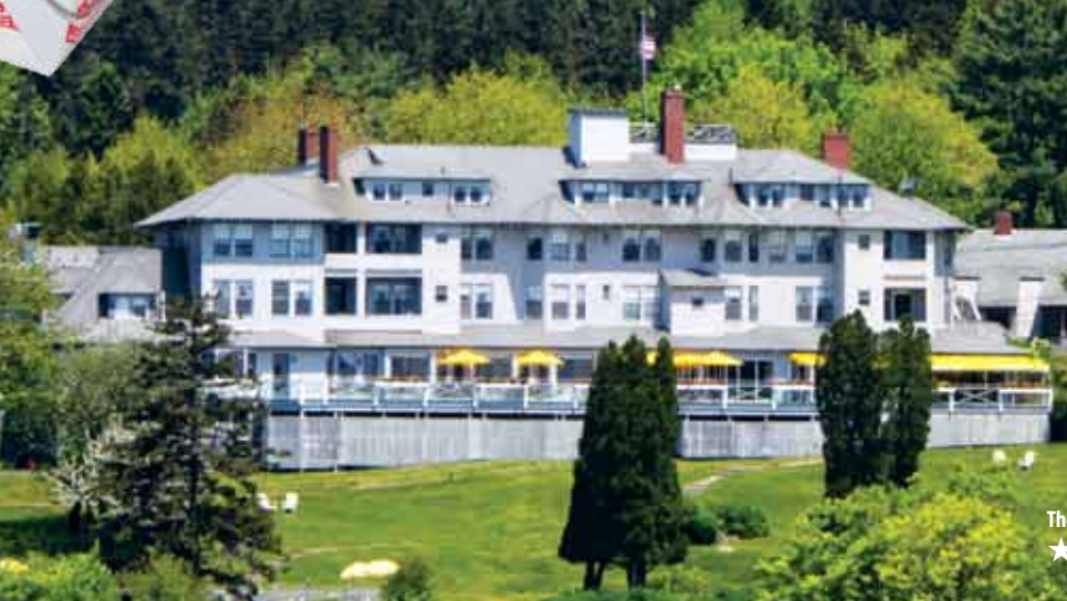
The Asticou Inn in Northeast Harbor ★★★★★ expedia.com