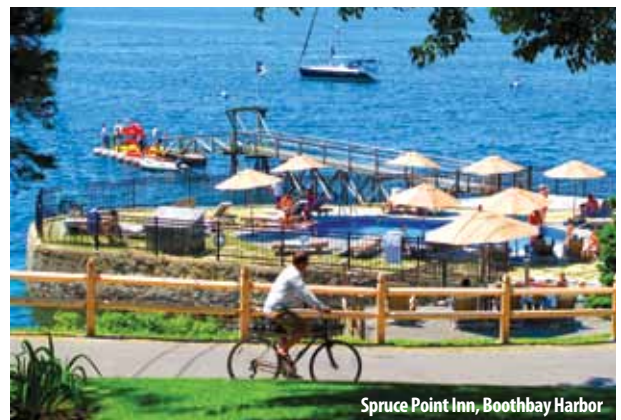
Spruce Point Inn, Boothbay Harbor

wear earrings and heels when you gaze out at the crashing surf, Travel & Leisure's Colleen Clark notes in her Best Affordable Beach Resorts list that the Tides Beach Club is "a renovated pink Victorian on Goose Rocks Beach...showing off a new preppy-glam look...with...the occasional zebra rug. A jewel-box bar serves oysters and bubbly and lobster service at fish-stick prices."