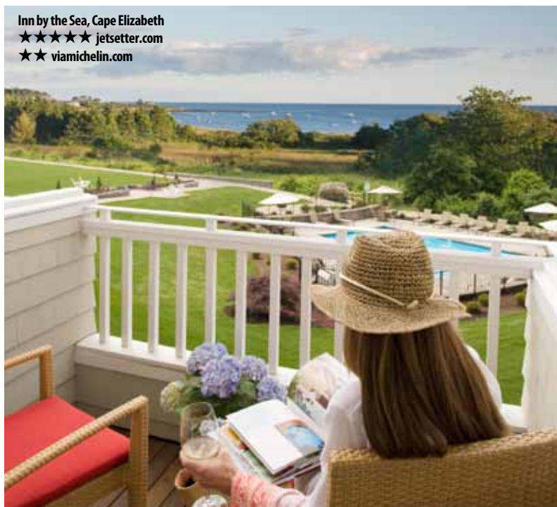
Inn by the Sea, Cape Elizabeth ★★★★★ jetsetter.com ★★ viamichelin.com

the Fodor's of 2014 may be just a bit too "awesome," as it provides little opinion or nuance beyond the predictable "fabulous views" and praise of room and bath size. Why have their descriptions become auto-tuned and robotic? An explanation of the Fodor's Choice ranking reveals that input from readers figures in the equation. And they've added something separate called "Fodorite Reviews," which are just comments from anyone with an opinion and a need to share it.