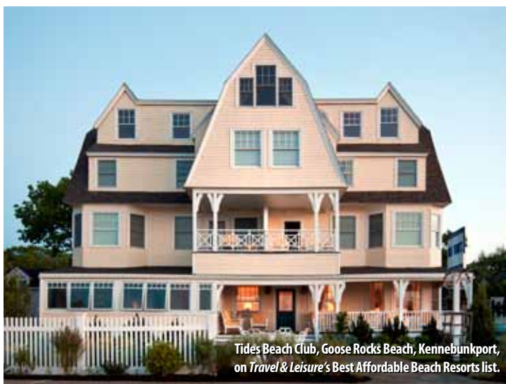
Tides Beach Club, Goose Rocks Beach, Kennebunkport, on Travel & Leisure's Best Affordable Beach Resorts list.

Not too long ago, if you were visiting Portland and you learned from your trusted guidebook about a hotel bar called the Top of the East—the highest roof bar north of Boston, so high it offered a view of the entire city—you'd go check out that glittering skyline yourself. You wouldn't consult your smartphone first for opinions about the service and drink prices.