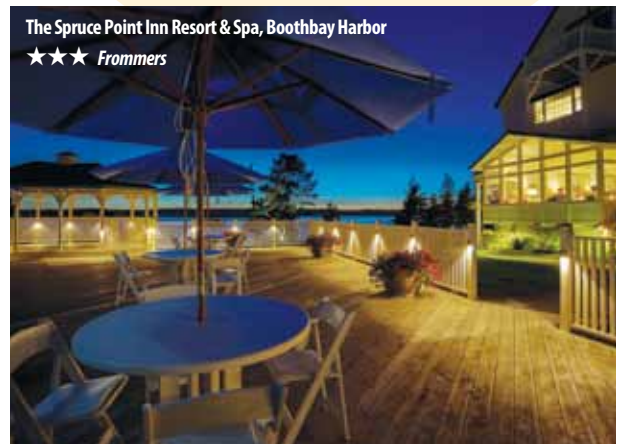
The Spruce Point Inn Resort & Spa, Boothbay Harbor ★★★ Frommers