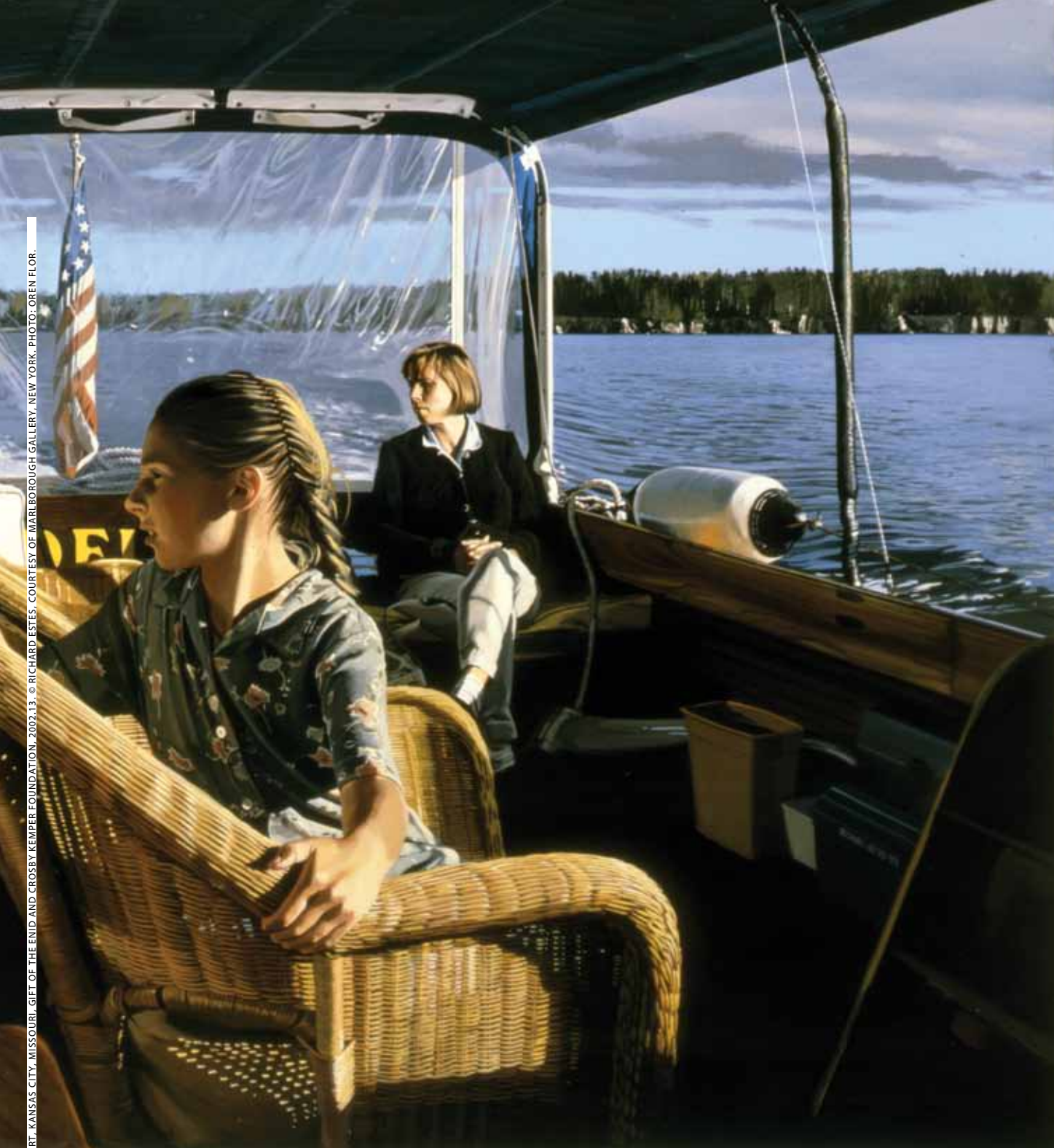
COLLECTION OF THE KEMPER MUSEUM OF CONTEMPORARY ART, KANSAS CITY, MISSOURI, GIFT OF THE ENID AND CROSBY KEMPER FOUNDATION, 2002.13. © RICHARD ESTES, COURTESY OF MARLBOROUGH GALLERY, NEW YORK.

Painter Richard Estes has a place already secured in history books as the leading proponent of painterly photorealism—one of the last true “isms” in art and a movement that changed the way we understand realism: While “realism” had been gauged by accuracy and verisimilitude, its standard is now the photograph.