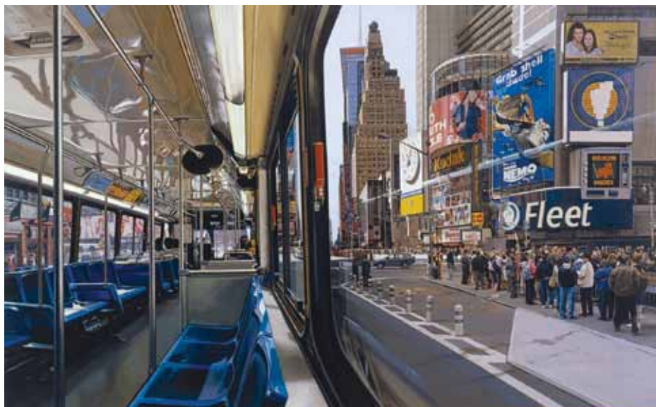
Estes tirelessly scrutinizes quotidian New York City moments, as in this tkts. Line , 38" x 61",

Are you still working on that painting of Columbus Circle?