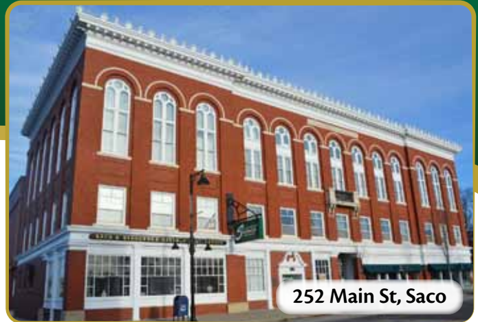
252 Main St, Saco

As Maine's Oldest Bank we've seen our share of history. Since 1827, through good times and bad, we've helped our fellow Mainers achieve financial security in the present while planning for tomorrow. Maybe that's why so many Maine families bank with us, generation after generation.