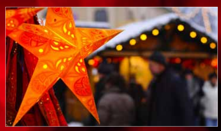
Outdoor bar, winter BBQ, holiday music, and Old Vines holiday swag