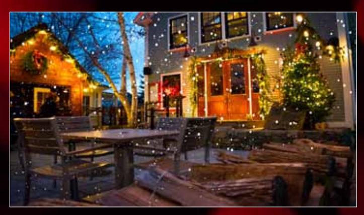
Holiday music, craft cocktails, and special events

Thursday, November 29 PRELUDE BLOCK PARTY KICKOFF