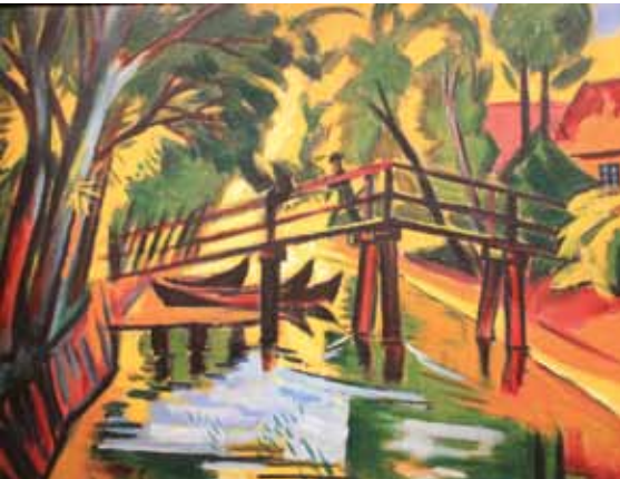
Clockwise from above: Early Morning by Max Pechstein; Head of Auguste Renoir by Aristide Maillol; Street In Kragero by Edvard Munch; and Stramm (Strong) by Wassily Kandinsky.

appeared from Germany in 1937, the year before Krystallnacht.