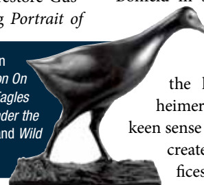
FROM TOP: EDGAR DEGAS, "FOURTH POSITION ON LEFT LEG"; CARL GUSTAV CARUS, "THE EAGLES"; PAUL GAUGUIN, "CABIN UNDER THE TREES"; FRANCIS POMPON, "WILD GOOSE"

Treasures in the Otten Collection include, from top: Fourth Position on Left Leg by Edgar Degas; The Eagles by Carl-Gustav Carus; Cabin Under the Trees, Tahiti , by Paul Gauguin; and Wild Goose by Francois Pompon.