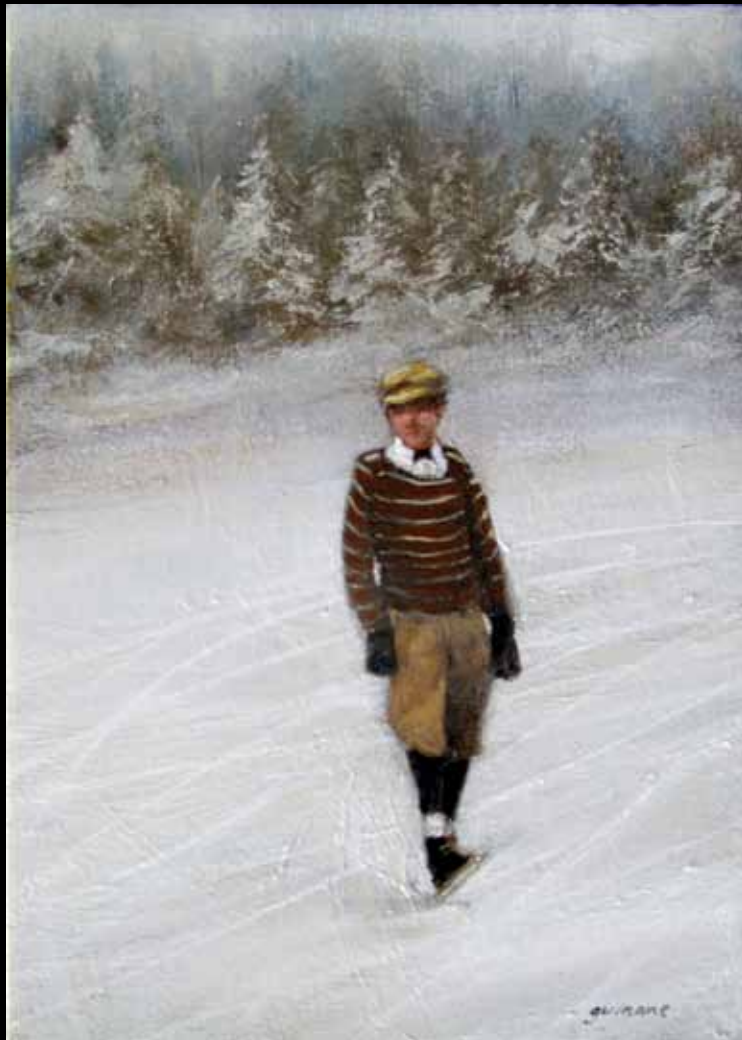
Ice Skater - by Michael Guinane - 5" x 7" acrylic and watercolor

21 Western Avenue, Suite 8, Kennebunk, Maine 207-967-6331 | www.TheSharpeGallery.com