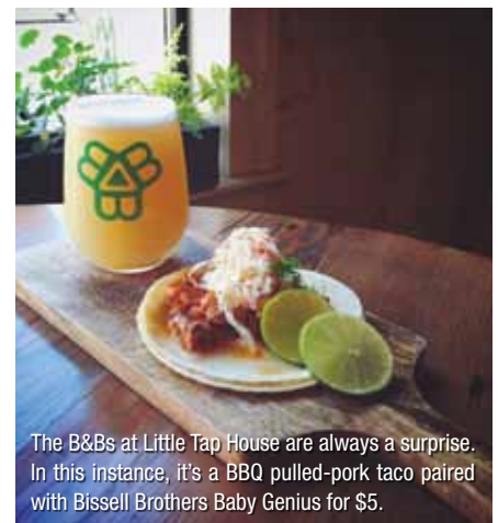
The B&Bs at Little Tap House are always a surprise. In this instance, it's a BBQ pulled-pork taco paired with Bissell Brothers Baby Genius for $5.