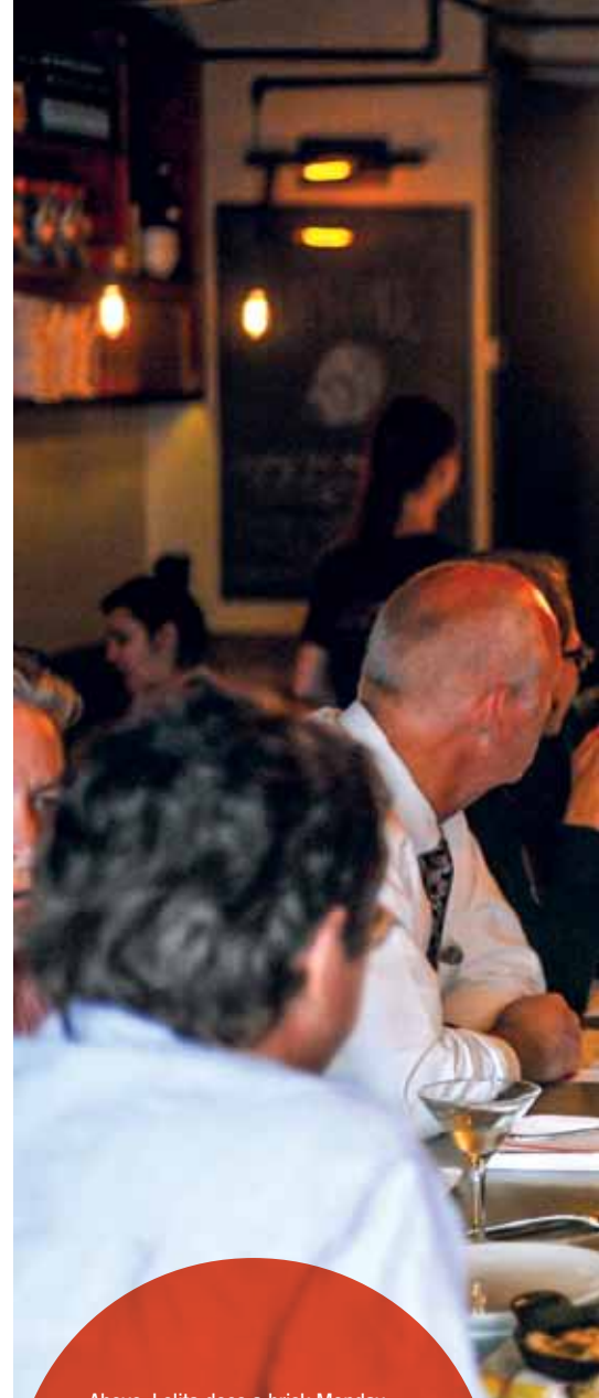
Above: Lolita does a brisk Monday Tapas trade, offering a glass of wine with a tasty bite for $5.