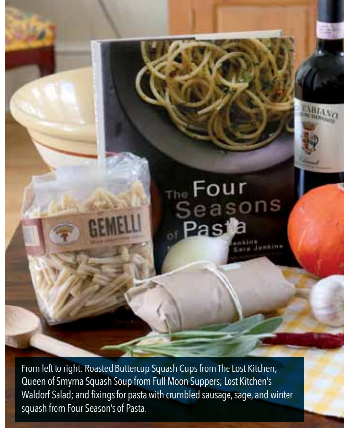
From left to right: Roasted Buttercup Squash Cups from The Lost Kitchen ; Queen of Smyrna Squash Soup from Full Moon Suppers ; Lost Kitchen's Waldorf Salad; and fixings for pasta with crumbled sausage, sage, and winter squash from Four Seasons of Pasta .