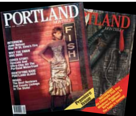
At left: Portland Monthly Magazine's premiere issue—April 1986—set a newsstand record with 70.1-percent sell-through. Right: The July 1986 cover poked gentle fun by wrapping fish in the Press Herald .

The Eames-era Deweys was filled with welcoming faces. "The employees ran the place. And that's what was so good about it. People trusted one another, people were