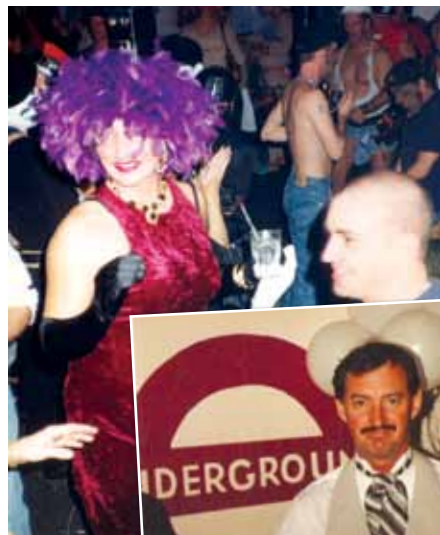
Before Styxx, there was the Underground.

"Every six months, you could play Casablanca or The Maltese Falcon . You could still get an audience because there was no other source. You couldn't watch them on television, you couldn't rent them and take them home," says Steve. "The big, big change came when cable and videotape made these [films] readily accessible."