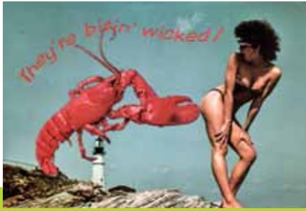
Greetings from Maine! An unusual 1980s postcard.

Petty, Metallica, and a kilt-wearing French artist who'd left his goose farm behind for a new start in Portland.