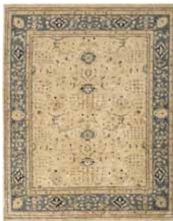
Peshawar Ziegler Cream / Soft Blue

300 Roundwood Drive | Scarborough, Maine | Tuesday-Friday 9-5, Saturday 10-5 800.292.4388 | 207.883.4388 | www.mougalian.com