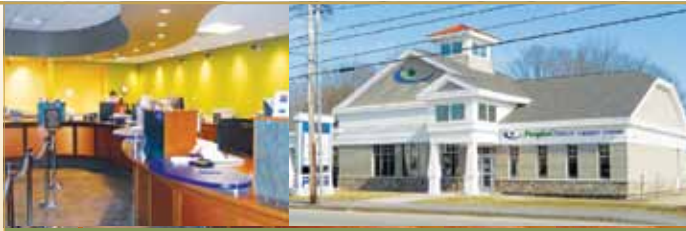
Peoples Choice Credit Union, Biddeford

Evolving needs and technology had Peoples Choice Credit Union needing a major renovation. PM Construction seamlessly performed all the interior and exterior renovations without disrupting the credit union's normal business hours.