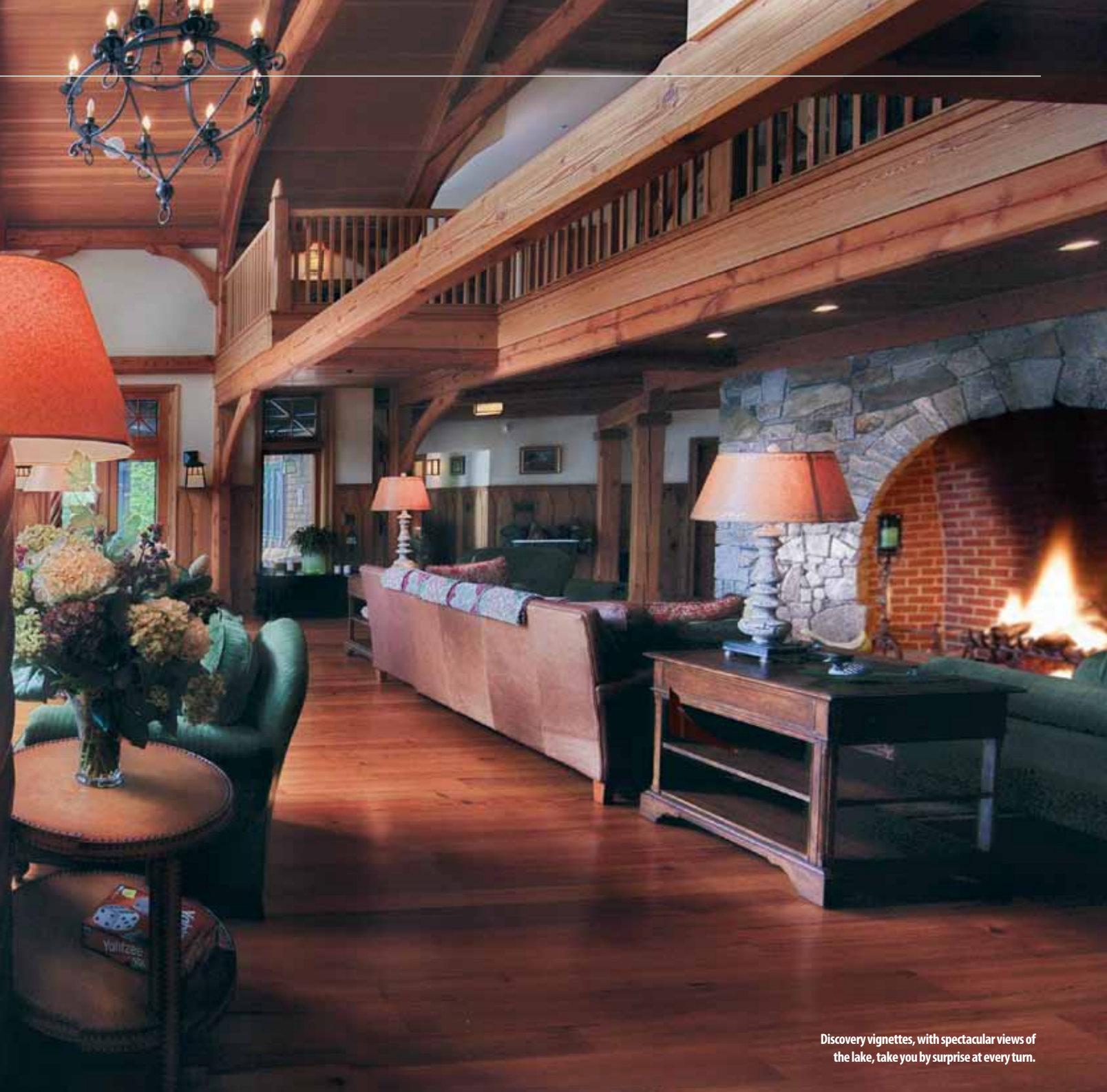
Discovery vignettes, with spectacular views of the lake, take you by surprise at every turn.

F rom Route 302, passing the boyhood home of Nathaniel Hawthorne as we approach the lake, we see Sebago burst into view like an inland ocean behind the 2006 structure that is Sand Hill Hideaway, with 1,300 feet of shore frontage.