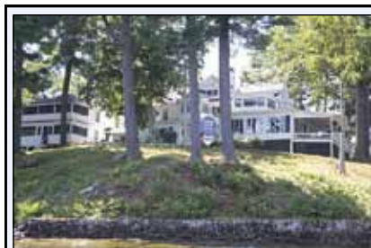
"You're already at the lake when you stay with us."

The upper gallery whirls around this palace,