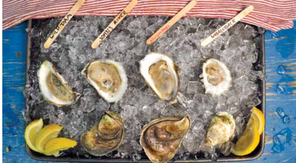
Above: One wild (left) and three farmed oysters from Damariscotta, "the gold coast" for Maine oysters. At upper left, a Flying Point; below right, a Maine Belon.