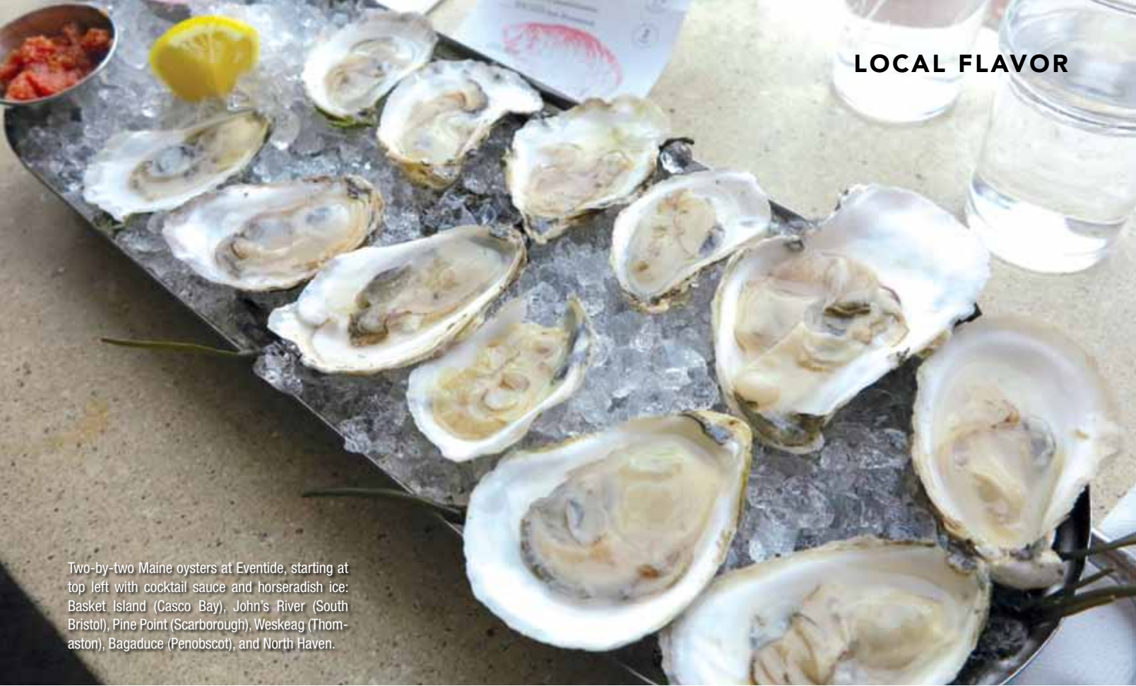
Two-by-two Maine oysters at Eventide, starting at top left with cocktail sauce and horseradish ice: Basket Island (Casco Bay), John's River (South Bristol), Pine Point (Scarborough), Weskeag (Thomaston), Bagaduce (Penobscot), and North Haven.