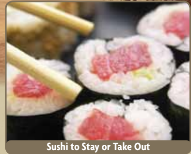
Sushi to Stay or Take Out

Three Restaurants in One, Oyster Bar, Wood Fire Grill and Sushi all under One Roof!