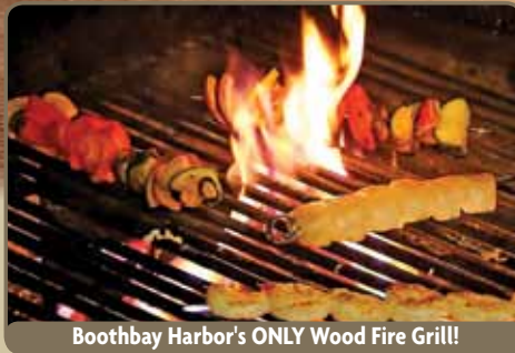
Boothbay Harbor's ONLY Wood Fire Grill!