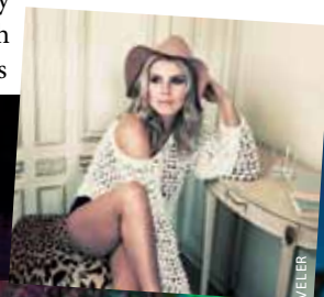
FROM TOP: WATERFRONT CONCERTS; COURTESY GRACE POTTER; BLUES TRAVELER