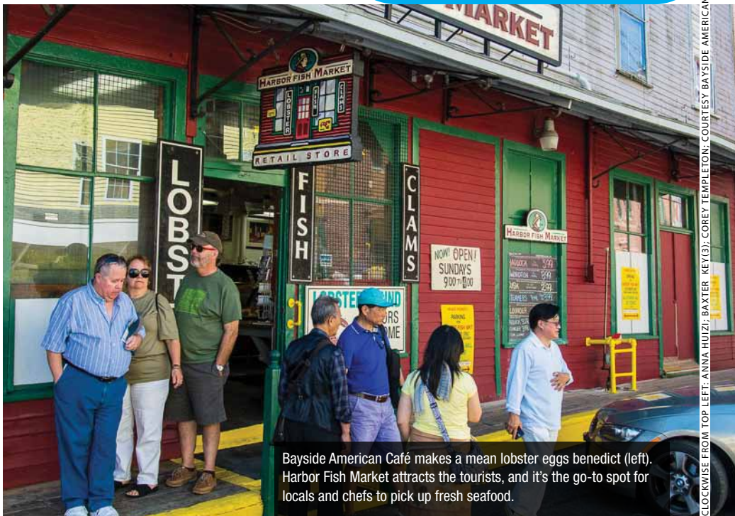
Bayside American Café makes a mean lobster eggs benedict (left). Harbor Fish Market attracts the tourists, and it's the go-to spot for locals and chefs to pick up fresh seafood.