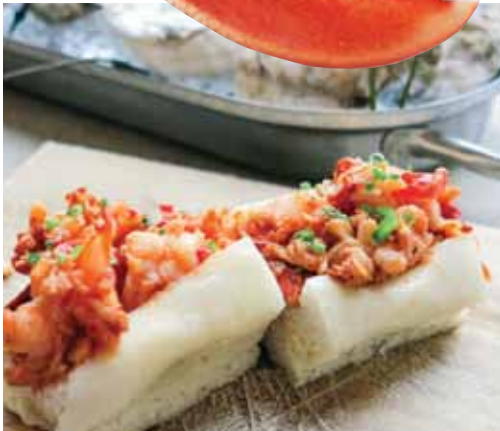
Eventide on Middle Street serves up a lobster roll a light-as-air bun, filled with lobster that's been quickly sautéed in brown butter.

Five perfect cylinders bound with ribbons of black nori seaweed are arranged artfully on a square plate with red-leaf lettuce, pale slices of pickled ginger, and a pyramid of wasabi completing the garnish. Dainty asparagus tips and pincers of lobster claw meat rise up from the rice, avocado, and julienned cucumber in each slice. The perfect Japanese lobster roll is as far east as you can travel from a lobster shack roll—and it's delicious. It's $10.50.