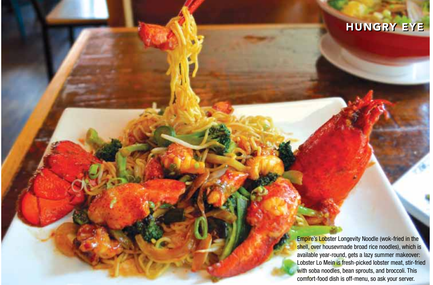
Empire's Lobster Longevity Noodle (wok-fried in the shell, over housemade broad rice noodles), which is available year-round, gets a lazy summer makeover: Lobster Lo Mein is fresh-picked lobster meat, stir-fried with soba noodles, bean sprouts, and broccoli. This comfort-food dish is off-menu, so ask your server.