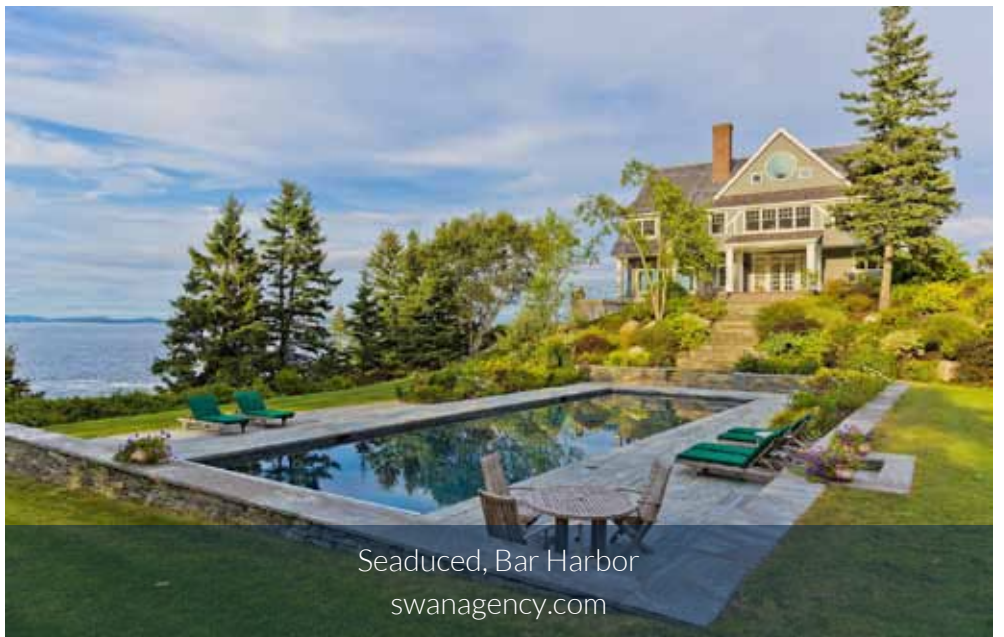
Seaduced, Bar Harbor swanagency.com