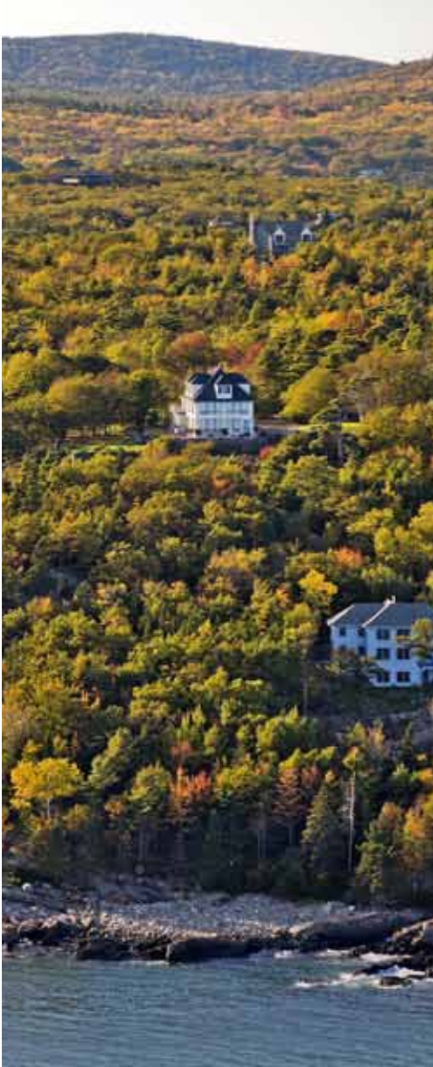
Greenway Court, Bar Harbor