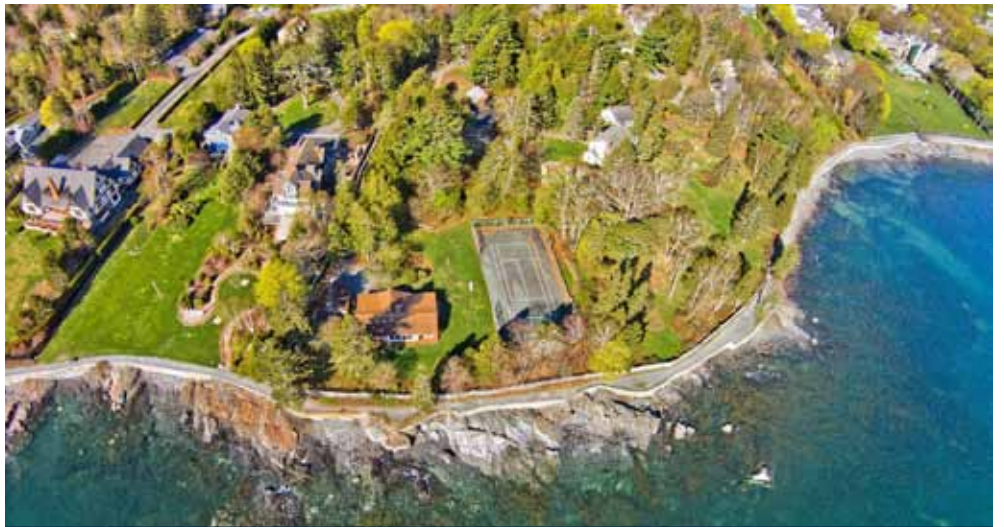
Reef Point, Bar Harbor