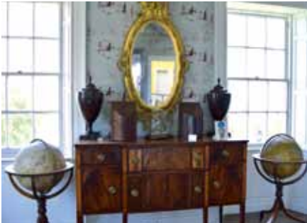
The rooms include wallpaper that celebrates the China Trade.

Historians felt sick about the loss of the famous artillery general's home. Patriots were outraged. But like a phoenix from the ashes, Montpelier took flight again in 1929, thanks to efforts by the Knox Memorial Association. Set on a hilltop not all that far from its original waterfront location, the recreated Montpelier was filled with stunning original antiques and opened to acclaim from visitors keen for all things Colonial Revival.