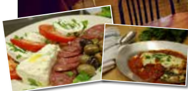
Six Course Italian Dinner for Two (Including a bottle of wine) $29 Per Person

Most romantic in the 1980s. Most romantic now.