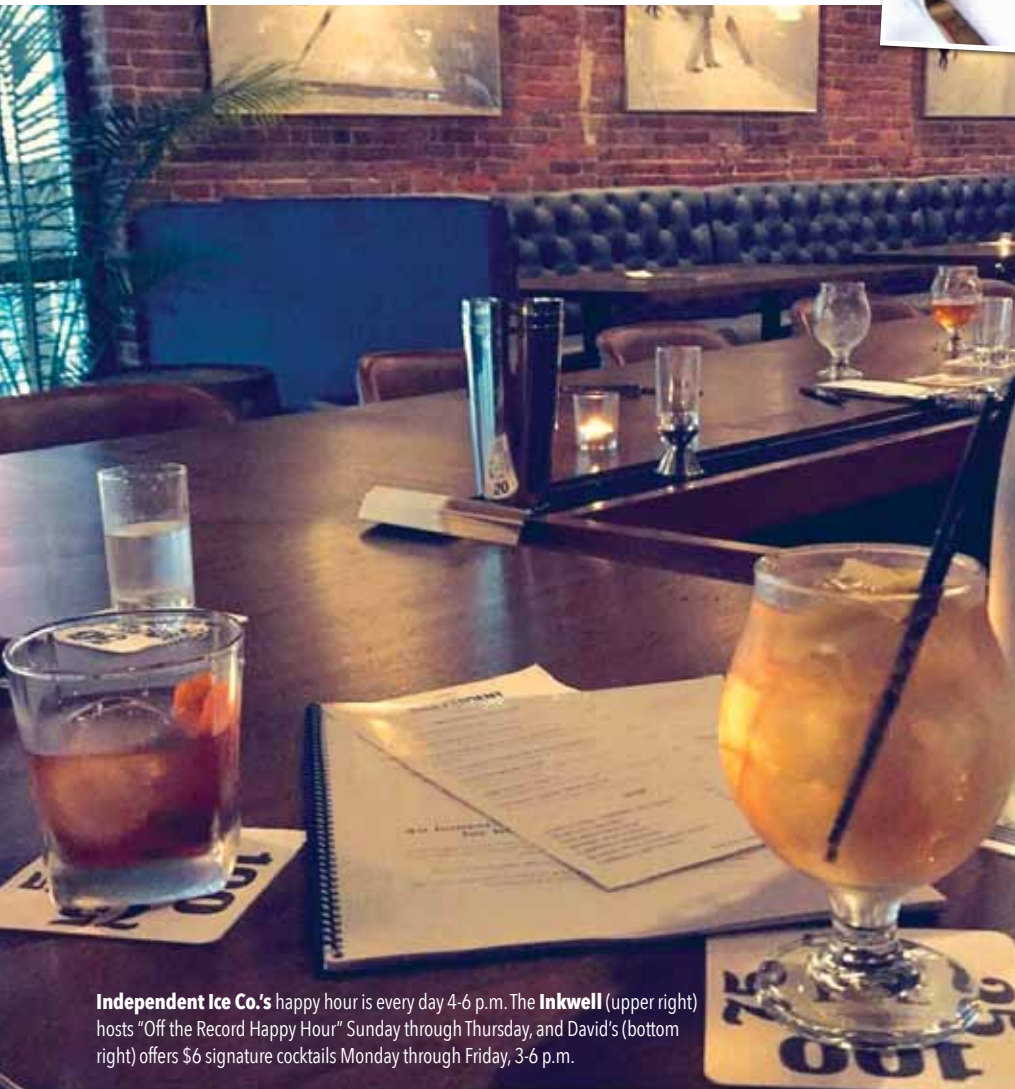
Independent Ice Co. 's happy hour is every day 4-6 p.m. The Inkwell (upper right) hosts "Off the Record Happy Hour" Sunday through Thursday, and David's (bottom right) offers $6 signature cocktails Monday through Friday, 3-6 p.m.

Cool off those dancing shoes with one of the "Pure Pours." The Knickerbocker Ice Boulevardier ($11) is the nightcap you need. The bourbon-based cocktail with a touch of campari, sweet vermouth, and orange peel is the final answer to this night and hopefully loosens you up just enough to ask, "What are you doing Tuesday?" ■