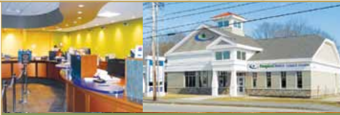
Peoples Choice Credit Union, Biddeford

Evolving needs and technology had Peoples Choice Credit Union needing a major renovation. PM Construction seamlessly performed all the interior and exterior renovations without disrupting the credit union's normal business hours.