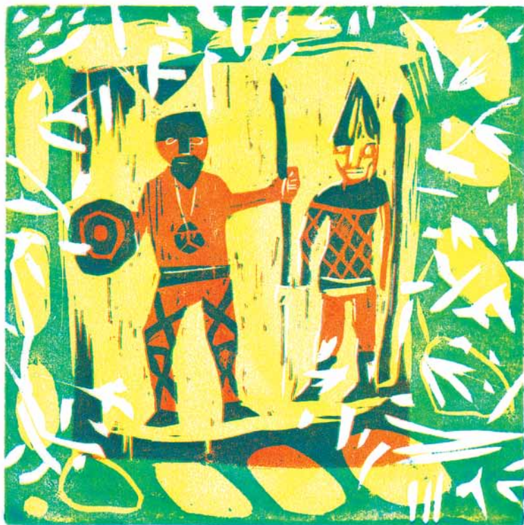
Patch's work reflects the influence of folk art and mythology in these two recent woodcuts. Left: Odin , 2015, 6.5" X 10". Above: Untitled , 2015, 8" X 8".

ple who asked if I'd seen their son's birds on the fourth floor. I had not, but went up to have a look.