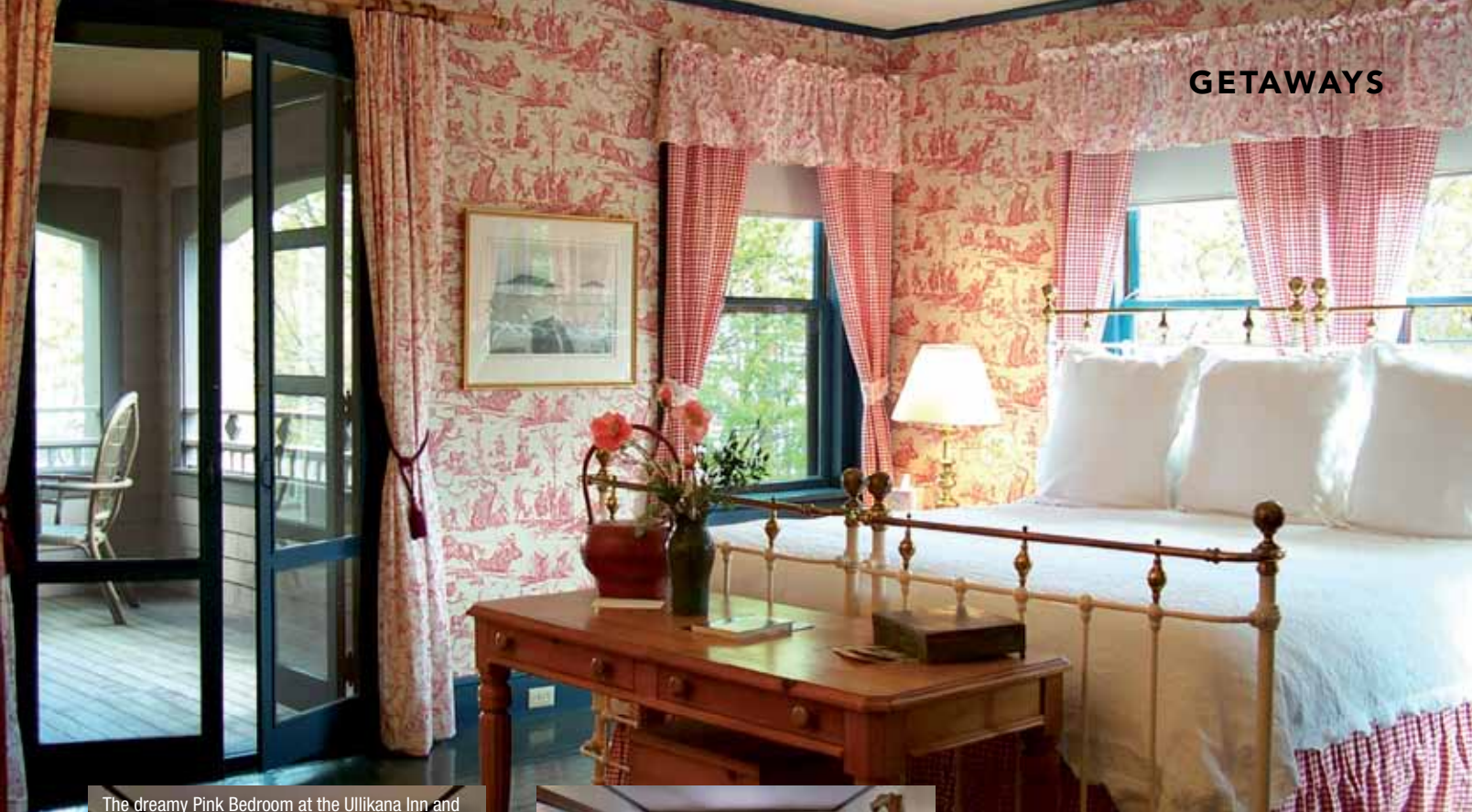
The dreamy Pink Bedroom at the Ullikana Inn and the polished common spaces reflect the original owner's Victorian-era China-trader tastes.