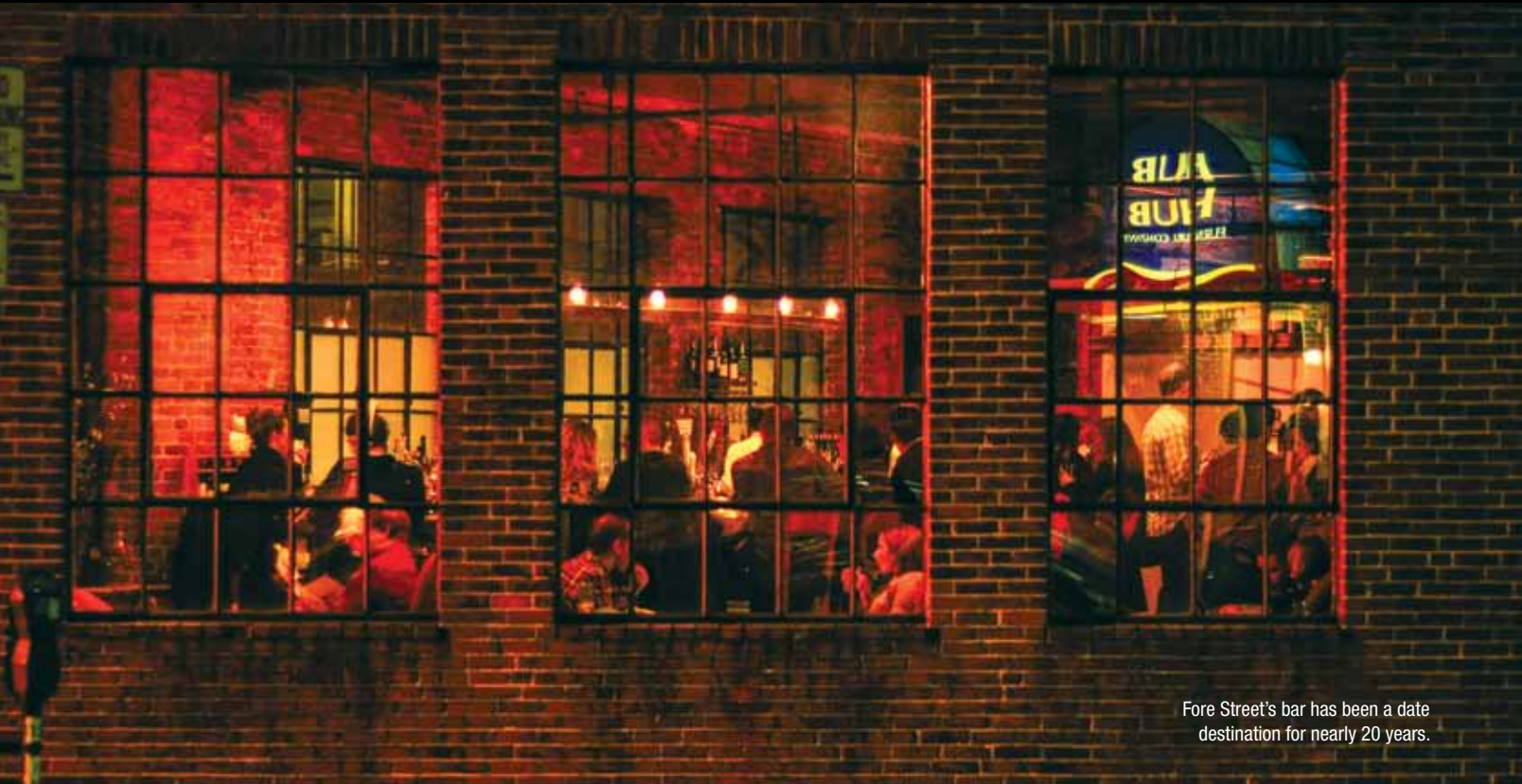
Fore Street's bar has been a date destination for nearly 20 years.

ward State. I'd overheard at a holiday party that there was a new "secret" bar on Congress. Hoping to find it before the other 30 people who overheard this secret, we agree tonight seems as good a night as any.