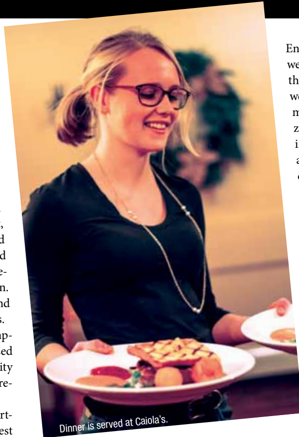
Dinner is served at Caiola's.

Around 7 p.m., we head back to Portland to celebrate with dinner in the West