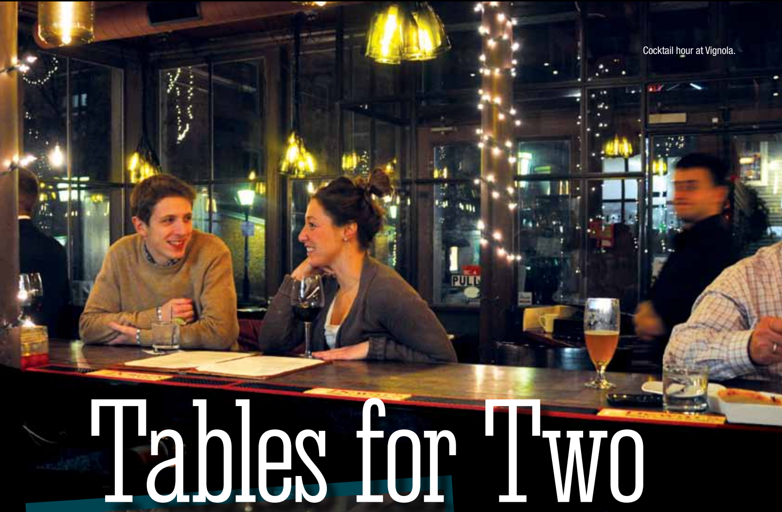
Cocktail hour at Vignola.