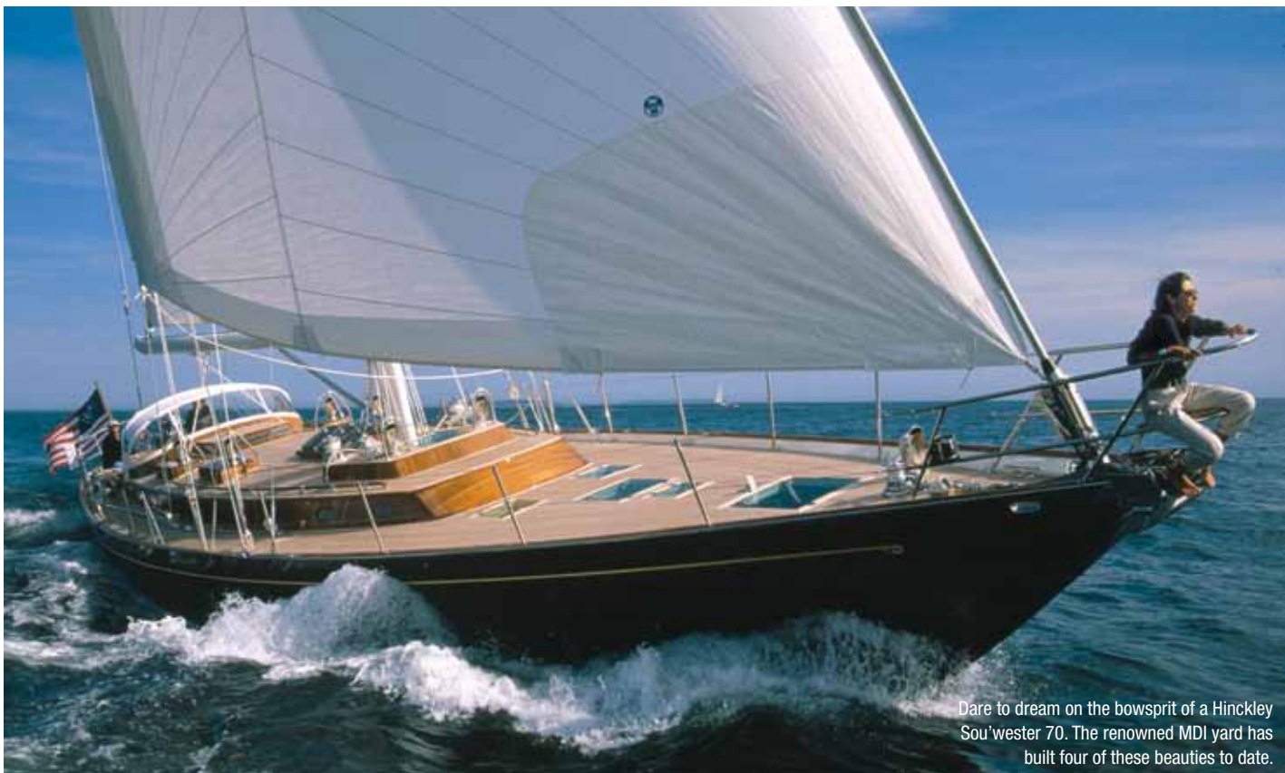
Dare to dream on the bowsprit of a Hinckley Sou'wester 70. The renowned MDI yard has built four of these beauties to date.