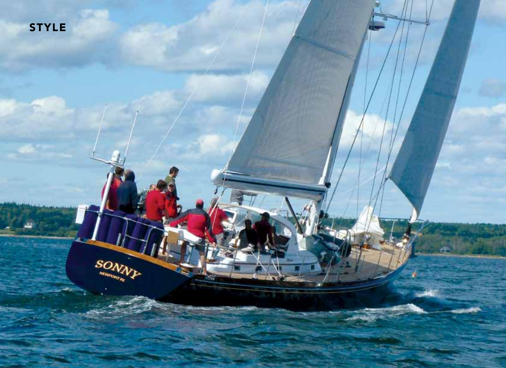
Sonny one so true: Another masterpiece from Brooklin Boat Yard stops the show on breezy Eggemoggin Reach.