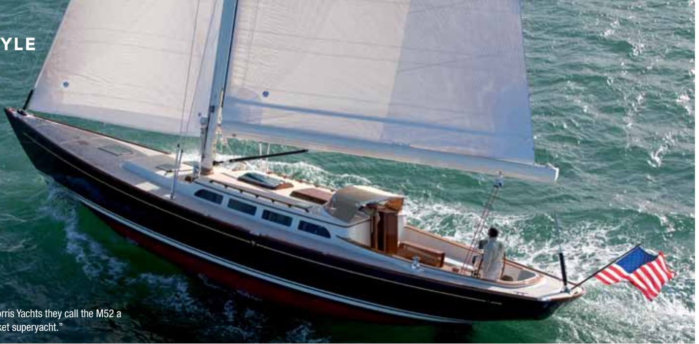
At Morris Yachts they call the M52 a "pocket superyacht."