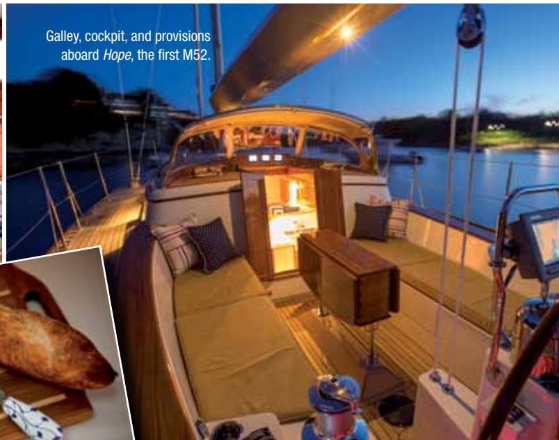
Galley, cockpit, and provisions aboard Hope , the first M52.