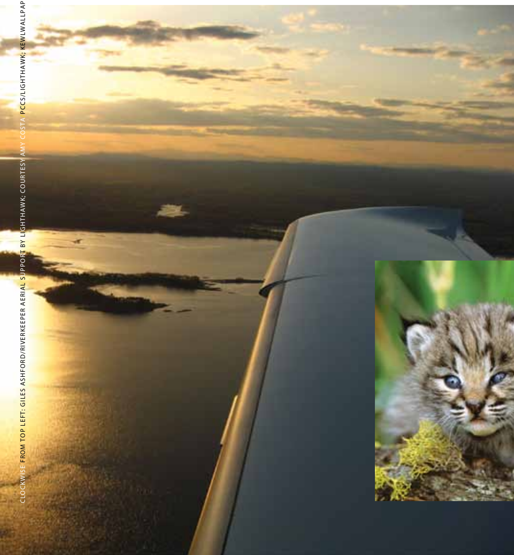
Clockwise from top left: LightHawk aircraft performing aerial patrol for Riverkeeper conservation group over a stone and asphalt quarry near Poughkeepsie, New York, where suspicious discharges into the Hudson River have been observed; Marc Costa of Provincetown Center for Coastal Studies takes photos of eelgrass beds off the coast of Massachusetts from a LightHawk aircraft. LightHawk-donated flights allow PCCS to monitor the health of eelgrass beds which grow in shallow bays and coves, tidal creeks, and estuaries and serve as nursery grounds and habitat for marine wildlife. Much of the eelgrass along the Eastern seaboard has been destroyed; "Tracking [bobcats] from the air is a game-changer for scientists and conservationists [in] understanding the habits of these energetic, feisty cats," says LightHawk's Bev Gabe; Engholm's sunset view over Maine's "Deer Isle on a donor flight."