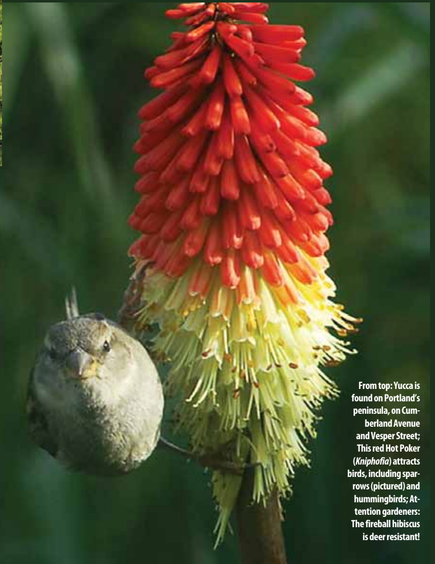
From top: Yucca is found on Portland's peninsula, on Cumberland Avenue and Vesper Street; This red Hot Poker ( Kniphofia ) attracts birds, including sparrows (pictured) and hummingbirds; Attention gardeners: The fireball hibiscus is deer resistant!