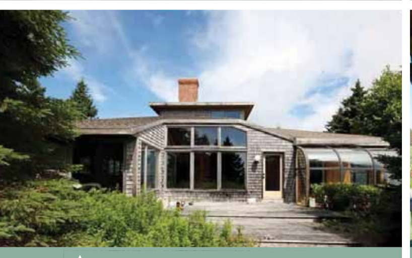
ADDISON, $1,500,000 1 Norton Island, 55 Acre Island