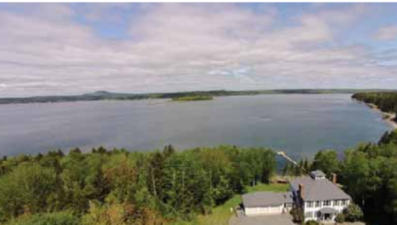
SURRY, $1,695,000 1591 Newbury Neck Road 23.7+/- acres with 630+/- feet of frontage

SULLIVAN, $1,895,000 Route 1,900ft. of Commercial Frontage, 22.95 Acres