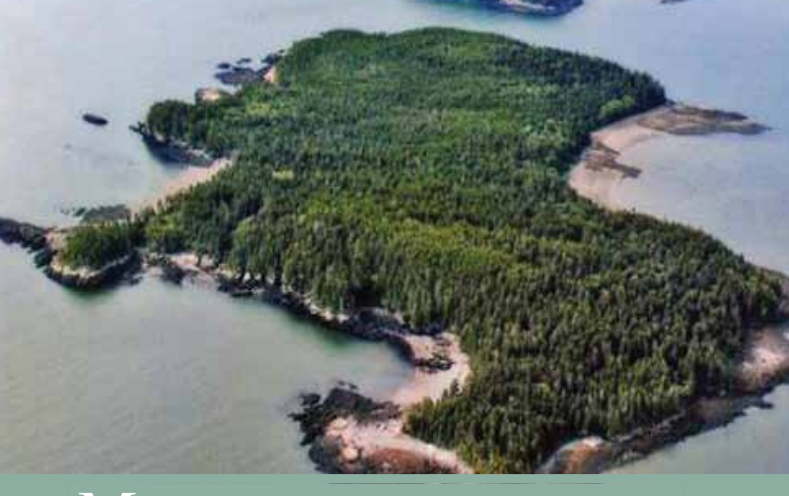
MACHIASPORT, $2,800,000 1 Bare Island, Private Island, 70 Acres

GOULDSBORO, $2,900,000 44 Workman Road, 660ft. Frontage / 9.5 Acres