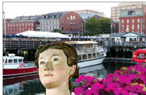
Left: The Maine Maritime Museum houses the oldest known figurehead in Maine, the Clarissa Ann (1824).

their days fashioning stern boards and tailboards; elegant scrollwork inscribed with the vessel's name to be mounted at the ship's bow; and 20-foot gilded eagles, wings outspread above banners emblazoned with the vessel's homeport. But of these works, it was the figurehead that symbolized the personality, even the life, of the ship itself. Ornate, imposing figures cut from Maine timber dashed across the seas in the form of exotic ladies; mermaids and mermen; or colorfully carved figures of Lincoln or Columbus, flung to far-away places by a