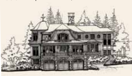
Fiorentino Group Architects’ blueprint of the proposed house.

main house at Walker’s Point. Neil Bush owns the little ranch house nearest the cove [and nicknamed Wandby ]. Jeb built a new house on the Point a few years ago. Doro has one, too.”