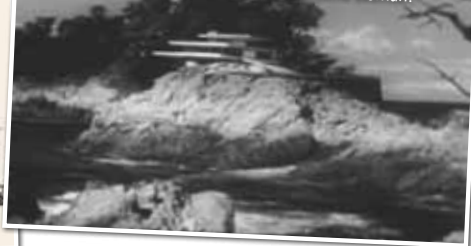
We think the lot’s asymmetry calls for the star power of the house in the 1950 film noir The Second Woman .